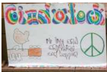
Poster by Haley Wisniewski

Saturday - the Cindystock music festival continues to mean excellent music, delicious food and an opportunity to use a relaxing day to support a good cause. Raffle tickets will be on sale along with a silent auction of items such as liquor baskets, golf, overnight stays and music memorabilia.