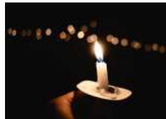
Hope—Let It Shine!